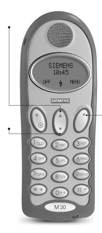
Complete survey of keypad functions and display symbols at pp. 52-53